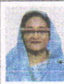
PRIME MINISTER GOVERNMENT OF THE PEOPLE'S REPUBLIC OF BANGLADESH Dhaka 26 Magh 1423 08 February 2017